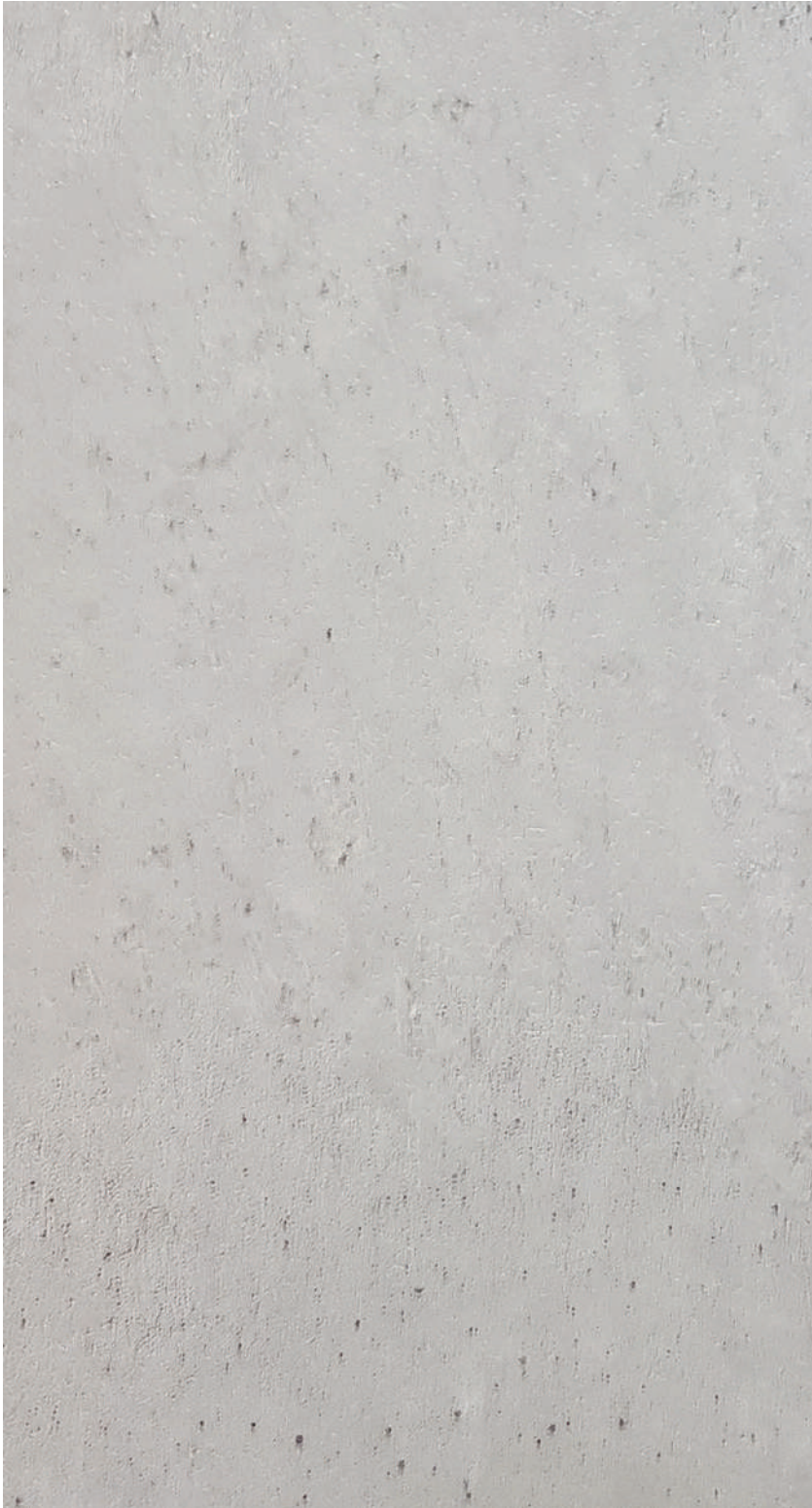
BETON LIGHT - ES3482362