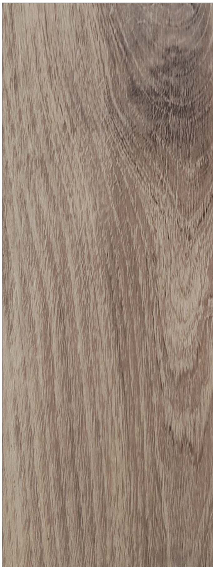
NORDIC OAK LIGHT - ES3487811