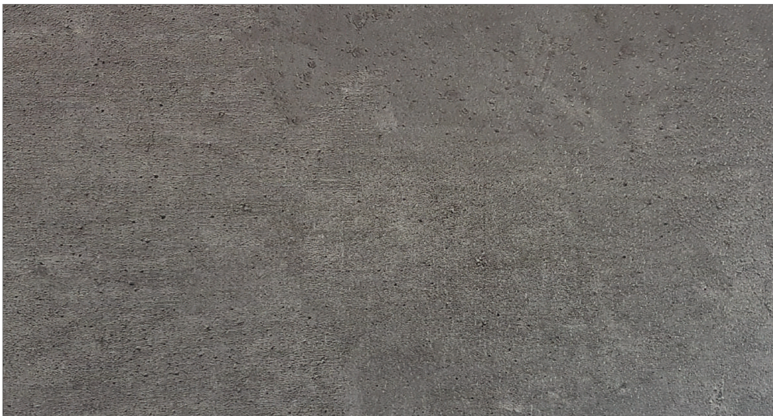
BETON DARK - ES3482369