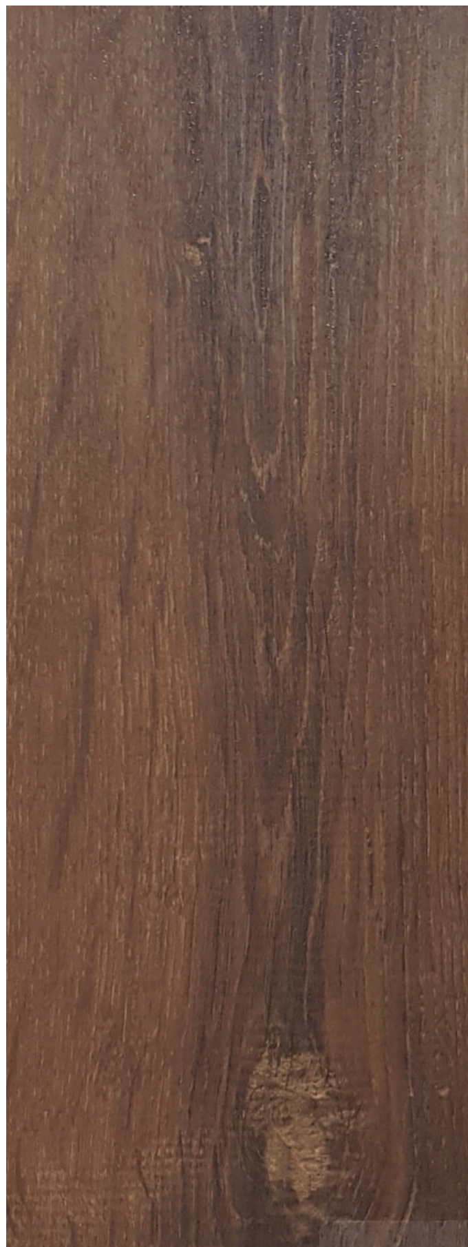
NORDIC OAK ANTIQUE - ES3487113