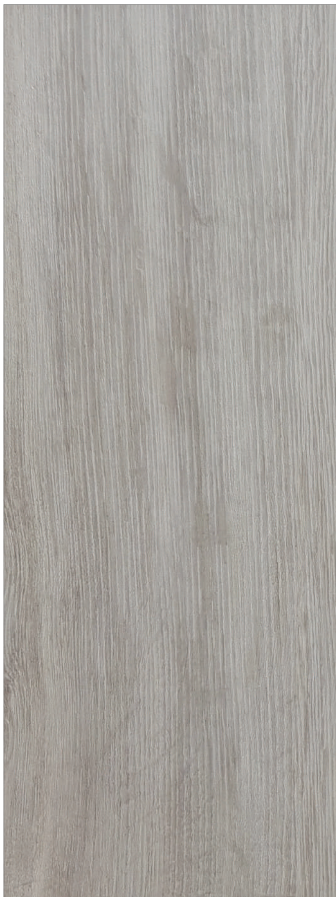
NORDIC OAK SILVER - ES3487514