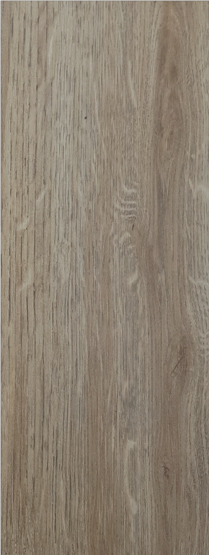
NORDIC OAK NATURAL - ES3488106

Emboss: Textured Concrete | Size: 906 x 448 x 4.8 mm