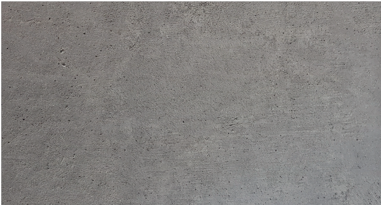
BETON MEDIUM - ES3482367