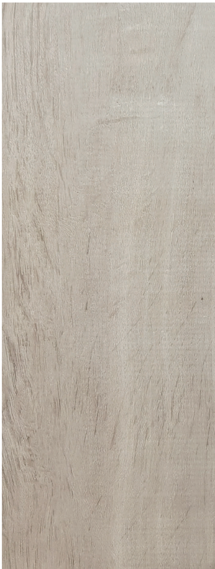
NORDIC OAK GREY - ES3487112